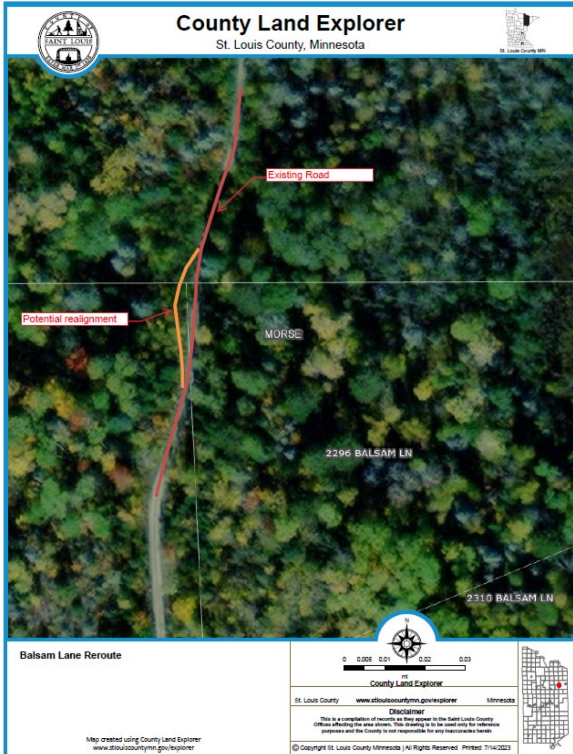
Figure 2. The image shows the locations of Balsam Lane, parcel lines, and the potential realignment location.